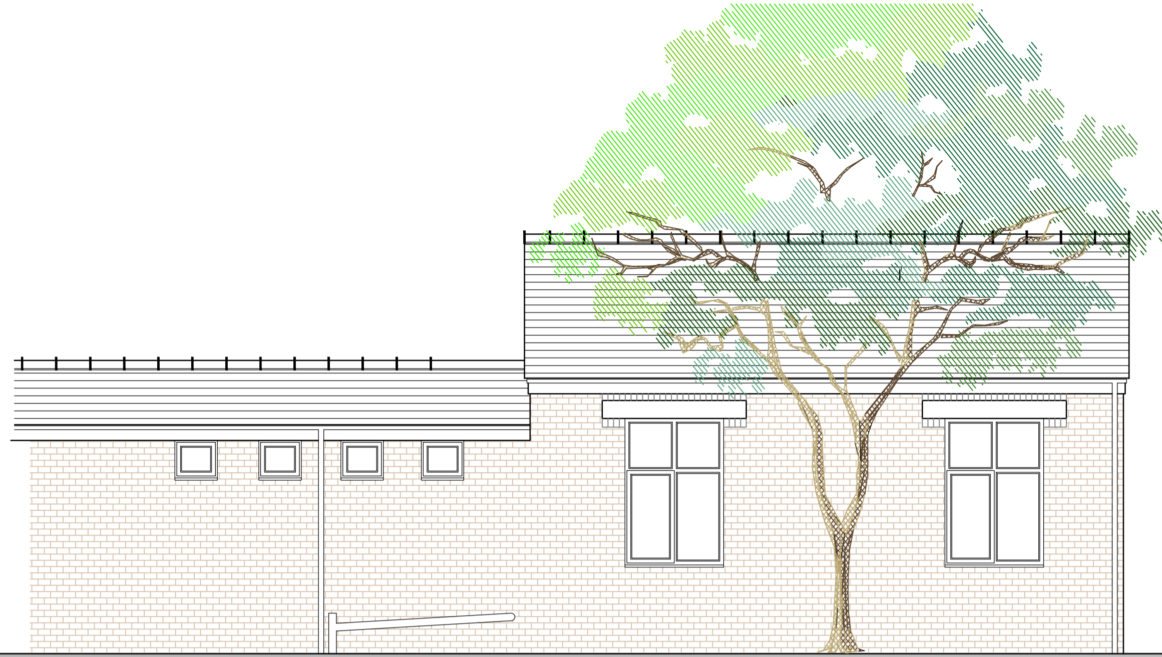
Part Existing Front (Road-facing) Elevation 'B' - 1:50