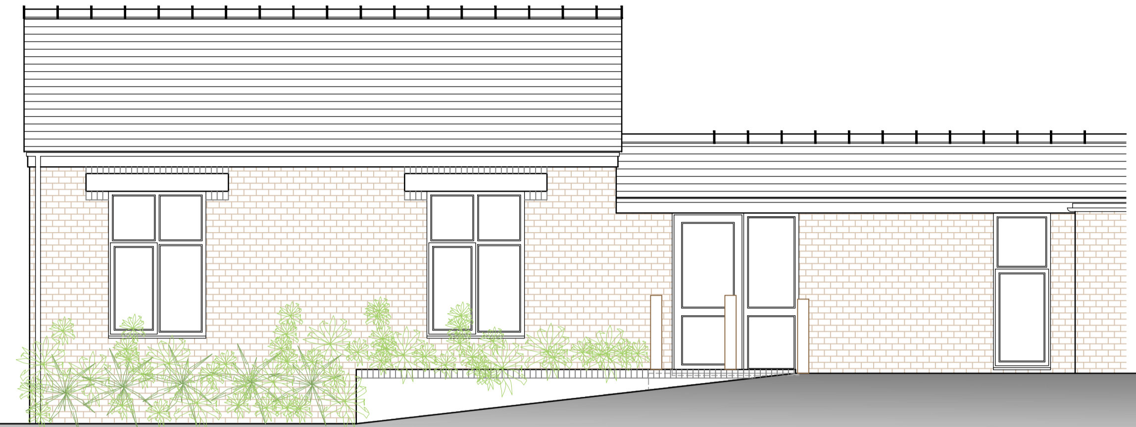
Part Existing Rear (Canal-facing) Elevation 'C' - 1:50